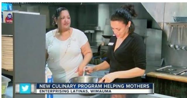
Culinary arts program offers opportunities for Wimauma residents

Catholic Volunteers in Florida wants to congratulate all of our volunteers for their hard work and accomplishments at their service sites thus far. Here are a couple highlights!